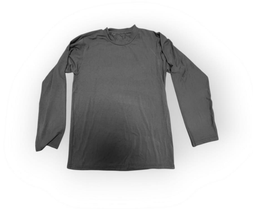
Adult Spring Pyjama (Top) with a low neck Fabric: Cotton