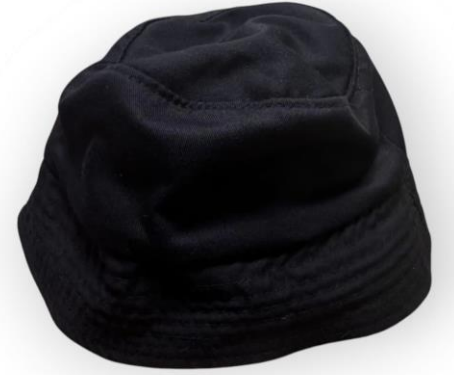
Fisher Cap Fabric: Gabardine