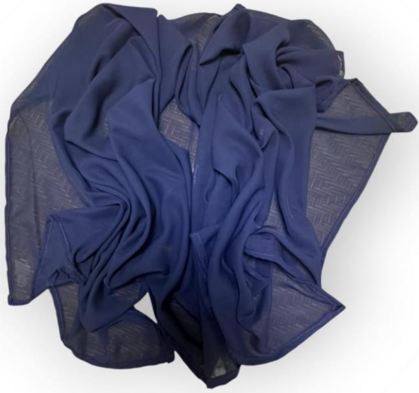
Hijab 220x70cmm Fabric: Chiffon