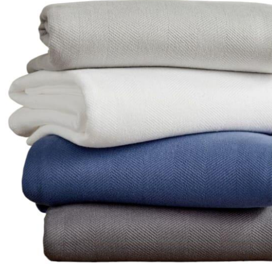
Blanket Fabric: Light Cotton