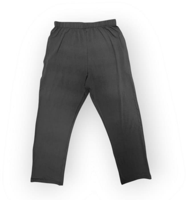
Adult Spring Pyjama (Pants) Fabric: Cotton