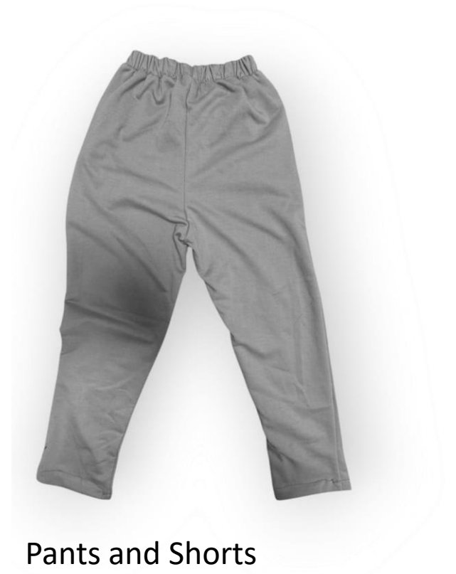
Pants and Shorts Fabric: French Terry/Cotton