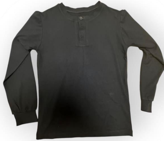
Regular Long Sleeve Shirt Fabric: Cotton, buttons