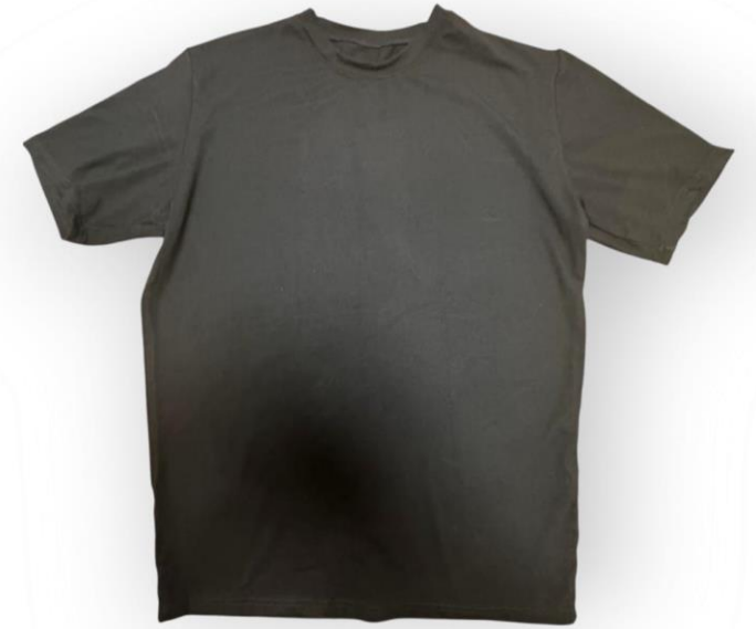
Regular T-Shirt Fabric: Cotton